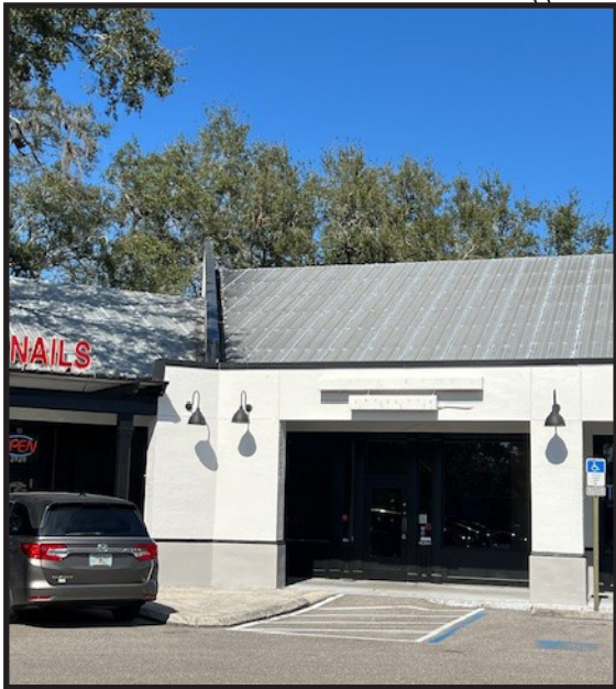
Suite 2822 - 2,016 Total SF

The information contained herein was obtained from sources believed reliable; however, RPM Realty Management, LLC makes no guarantees, warranties, or representations as to the completeness or accuracy thereof. The presentation of this property is submitted subject to errors, omissions, change of price or conditions prior to sale or lease, or withdrawal without notice.